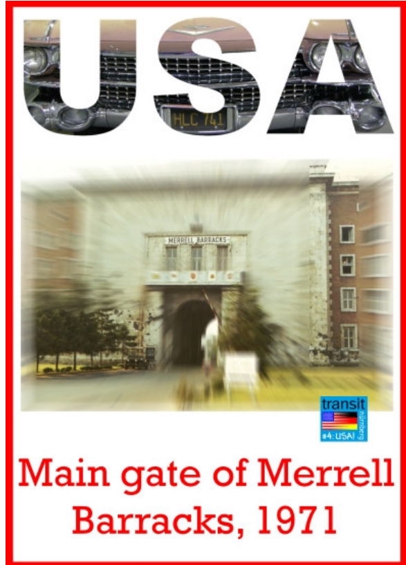
Main gate of Merrell Barracks, 1971