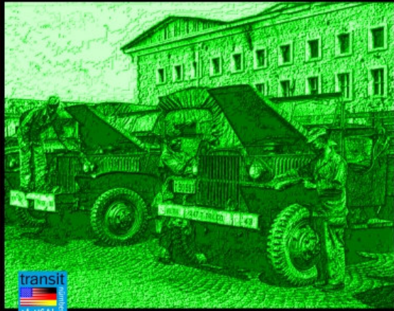
Afro-American G.I.s of the 447th TC Truck Company, 1948