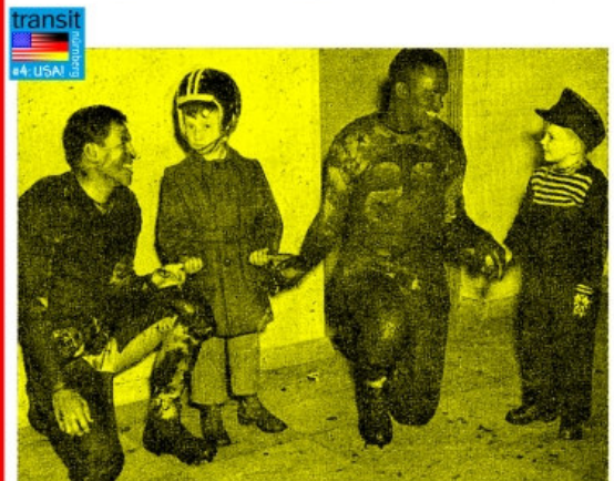
Nuremberg Tigers footballers with German fans, 1950