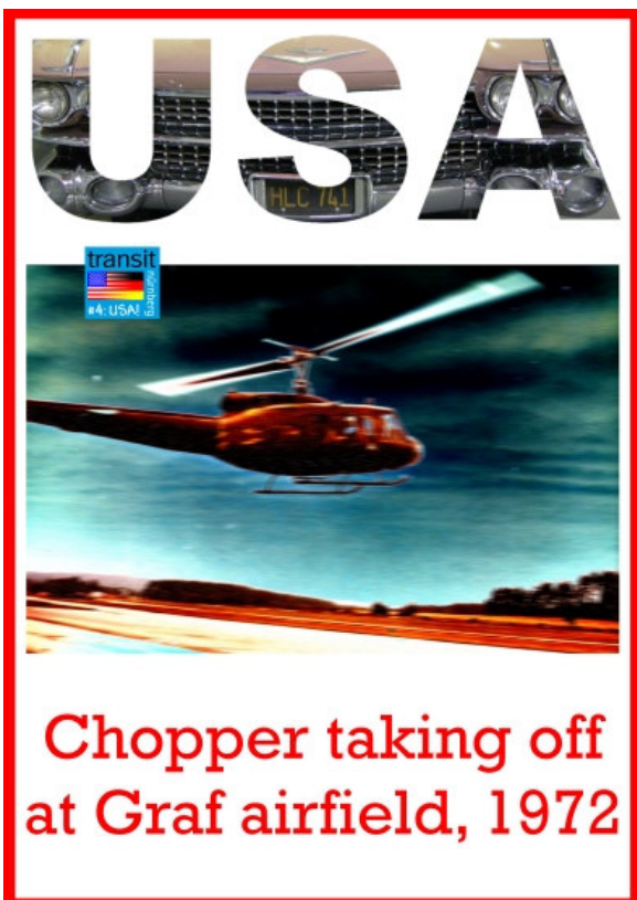
Chopper taking off at Graf airfield, 1972