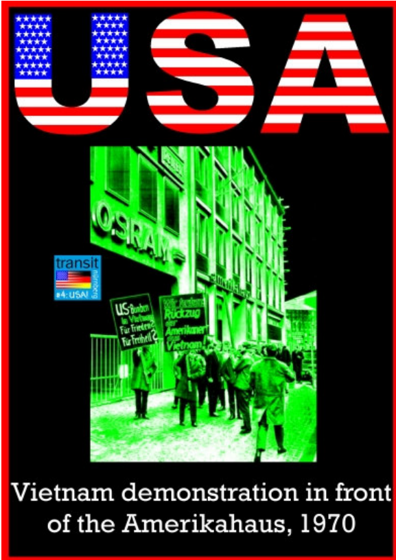
Vietnam demonstration in front of the Amerikahaus, 1970