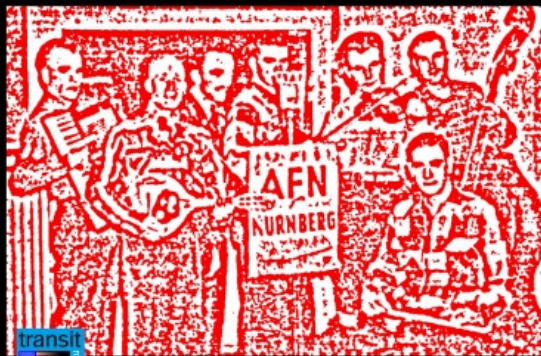
The Lucky 7 Ranch Hands playing for AFN Nuremberg, 1950