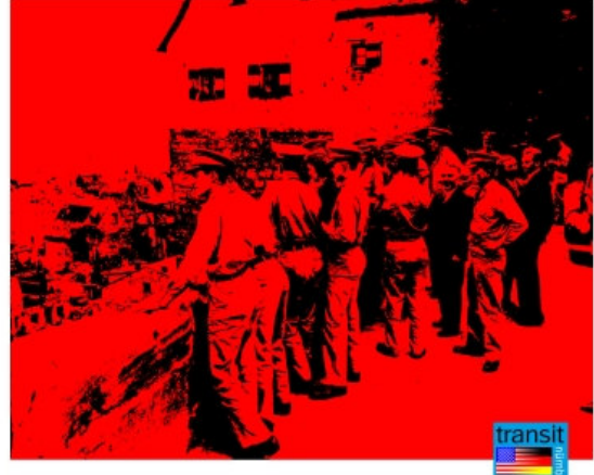
West Point cadets visiting the Kaiserburg, 1949